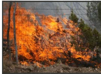
Wildfire south of Iraan, Texas, burns on Wednesday, April 13, 2011.

nonprofit organizations and individuals have contributed to the recovery fund, and donations were made online.